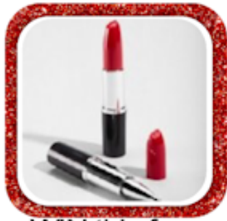
WIN this fun Lipstick Pen!

Earn fabulous prizes when you work your business this month!!