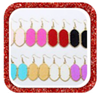
WIN Kendra Scott Look Alike Earrings!