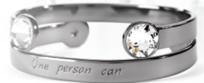
"One Person Can"

Get the year of your dreams off to a great start with this yearlong challenge! Each month during the year that you place a cumulative $600* or more wholesale Section 1 order, you can receive a gorgeous bracelet with a quote that reflects Mary Kay Ash's legacy of love.