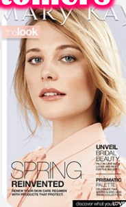
The Look mails Feb. 15th be sure to follow up!