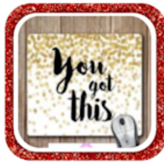
WIN the "You Got This" Mouse Pad!