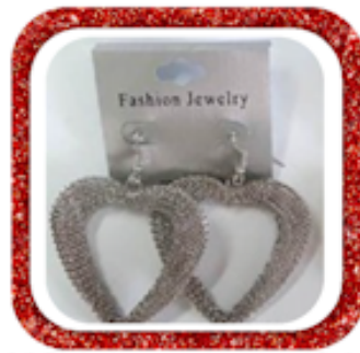
WIN these beautiful Heart Earrings!